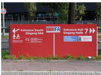
S-Bahn station “Messe Süd”

Leave the S-Bahn station “Messe Süd” at its East exit (!) , follow the Jafféstraße to the right/East , walk around the CityCube Berlin building, then walk up the stairs to the entrance of Hall 7 . This is the only entrance that is open early enough for our conference to start at 09:00 h , all other IFA entrances will open at 10:00 only – so do avoid the South entrance!!! And you need to have your IFA ticket with you! Our conference is on the third floor, room 7.3 “Berlin” .