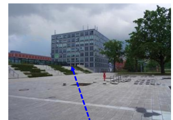
TecWatch Hall 11.1